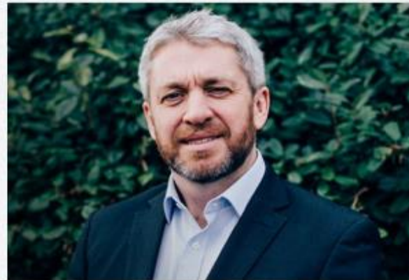
GREENHALGH KERR | SOLICITORS

Operating since 2000, Greenhalgh Kerr are Solicitors specialising in dispute resolution and are particularly known for their work in relation to debt recovery within the Local Government arena. Acting on behalf of Braintree Council, Greenhalgh Kerr were instructed to pursue an unpaid liability order against a company operating from premises in their area.